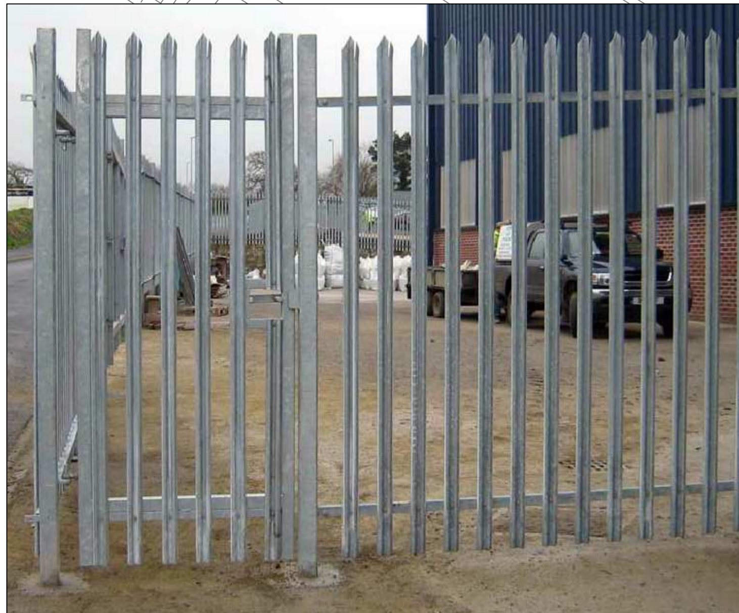
Example of a Palisade fencing.

There is a clear view of the activities happening beyond the fence. With the proposed lighting around the area of new works, it should act as a deterrent for sexual or other illegal activities.