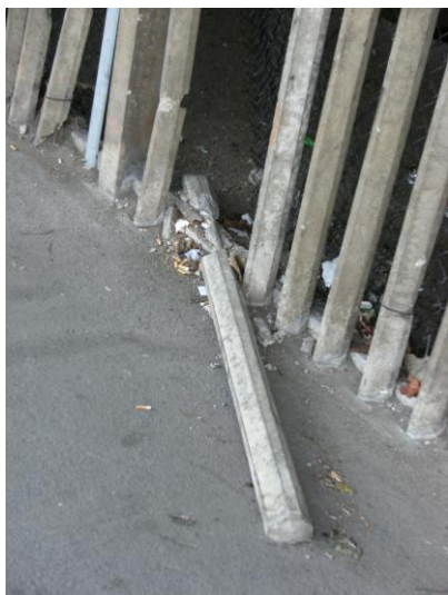
Fencing by M32 planned to be replaced by end of February 2013