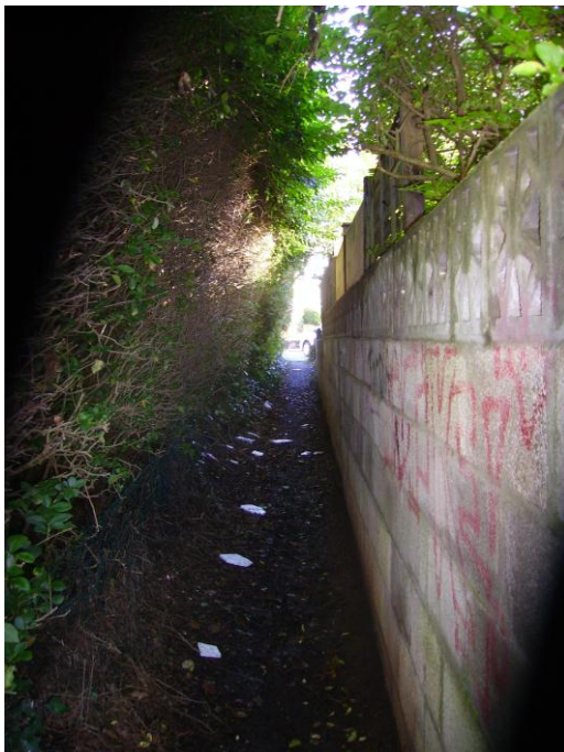
Unofficial lane in Pound Drive subject to planned closure. This area experiences frequent and serious ASB